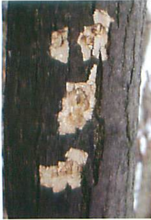
Figure 5. Jagged holes left by woodpeckers