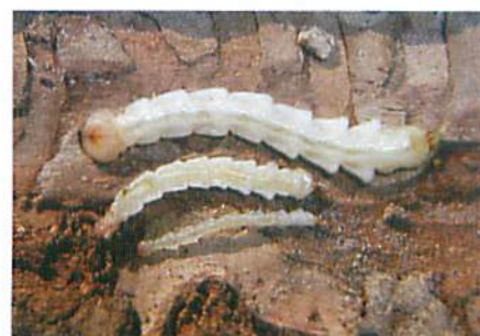
Figure 2. Second, third, and fourth stage larvae.