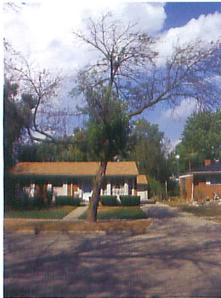
Figure 6. Much of the canopy is dead on a heavily infested ash tree.