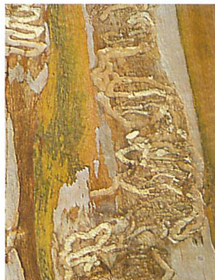
Figure 3. Galleries excavated by larvae.