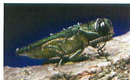
Figure 1. Adult emerald ash borer.

Feeding is completed in autumn and pre-pupal larvae overwinter in shallow chambers excavated in the outer sapwood or in the bark on thick-barked trees. Pupation begins in late April or May. Newly enclosed adults often remain in the pupal chamber for 1 to 2 weeks before emerging head-first through a D-shaped exit hole that is 3-4 mm in diameter (Fig. 4).